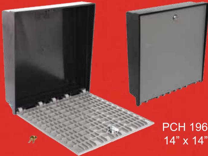
PCH 196 14" x 14"

Mechanical layout drawings available on our website www.thehousingcompany.com