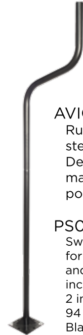
PS094-AVIB Swivels 360 degrees for aiming flexibility and top cap set screws included 2 inch OD Pipe 94 inches total height Black powder coated