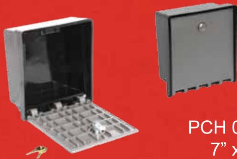
PCH 049 7" x 7"