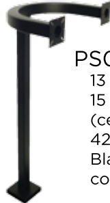
PS042B-UDP 13 inch throw 15 inch separation (center to center) 42 inches high Black powder coated