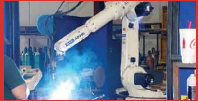
Welding the steel goosenecks pedestals with a robotic welder