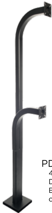
PD114B 40 and 72 inch Dual Height Black powder coated