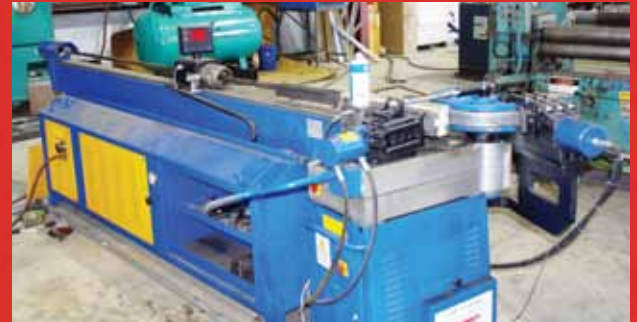
Did you ever wonder how the goosenecks are bent? This is our new Mandrel Bending machine

PSF036 Pedestals are cloned to Federal APD/3M specifications PSF036 Gooseneck Throw is 9.0 inches